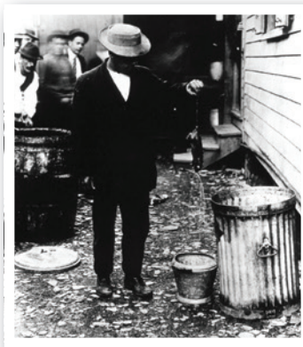
Plague epidemic in New Orleans, 1913–1914

Yellow Fever. An acute infection caused by an RNA virus spread, primarily by the female Aedes aegypti mosquito, yellow fever was one of Louisiana's deadliest diseases before the early twentieth century. The mosquitoes carrying the disease typically hitchhiked to Louisiana aboard trading ships from their native Caribbean habitat. Mortality rates climbed as high as 60 percent during some epidemics, and in the New Orleans region, the disease was responsible for more than 41,000