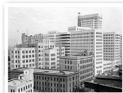
Louisiana State University Medical School, c. 1939

Today, Tulane, LSU, and Ochsner are joined by Tulane National Primate Research Center, LSU Shreveport, Southeastern Louisiana University, and other smaller research institutions contributing to growth of immunology research in Louisiana. ■