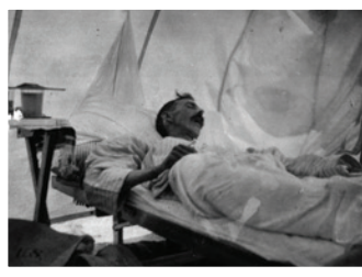
Yellow fever patient in hospital

Louisiana, because of its subtropical climate and home, near the mouth of the “Mighty Mississippi,” to the premier southeastern port in the United States, has been the site of many lethal and chronic communicable diseases, including yellow fever, malaria, hookworm, Hansen's disease, and bubonic plague. The presence of these diseases has channeled the current of biomedical research in the state.