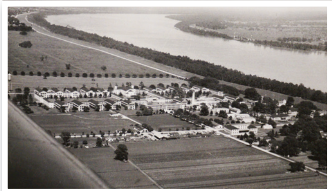
National Leprosarium, ca. 1950

The state opened the Louisiana Leper Home in Carville in 1894 and two years later, entered into a contract with the Daughters of Charity of St. Joseph, located in Emmitsburg, Maryland, to care for and treat its patients. 3 In 1921, the USPHS took operational control of the institution and established it as the National Leprosarium , in accordance with a 1917 federal law mandating the founding of a hospital for leprosy patients. 4 In addition to treating patients, the facility was updated to become a center for research into Hansen's disease (leprosy) transmission and treatment. Researchers at Carville demonstrated