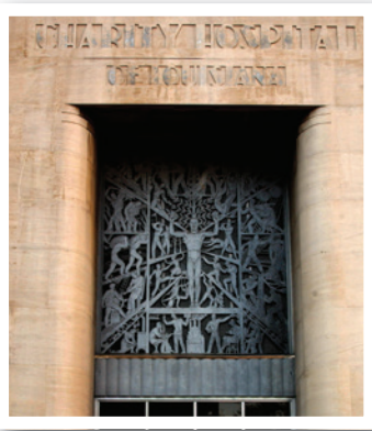
Charity Hospital, c. 1939

Recognizing the need for a public hospital in New Orleans to serve the poor, a French ship builder residing in the city bequeathed money for what would become the city's venerable Charity Hospital . The hospital was founded on May 10, 1739, and operated constantly until 2005, when Hurricane Katrina forced its closure. At that time, Charity Hospital was the second-oldest, continuously operating public hospital in the United States. 1 Charity also served as a teaching hospital for Tulane University and Louisiana State University (LSU) medical schools, where many AAI members held appointments.