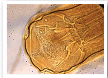
Head of the hookworm Necator americanus