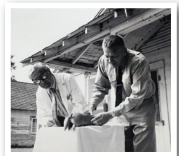
Hansen's disease research

Hansen's Disease (Leprosy). This disease was well established in Louisiana, particularly in southern Louisiana. By the late 1880s, high incidence rates (4.5/100,000) in the state, especially in South “French” Louisiana, led to the creation of the Louisiana Leper Home in Carville to treat patients and research the disease. Infection rates continued to rise until the late 1920s (12/100,000), with the highest rates still observed in French Louisiana. Antibiotic treatments beginning in the 1940s successfully brought incidence in the state to near zero by the 1970s. 11