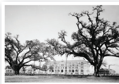
Tulane University, c. 1900

Two of the state's oldest medical schools are located in New Orleans. Tulane University School of Medicine was founded in 1834 as the Medical College of Louisiana, with the purpose of leading "the advancement of science and the rational treatment of disease." Tulane issued Louisiana's first medical degree in 1835 and was one of two southern institutions identified as "excellently