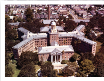
U.S. Marine Hospital/U.S. Public Health Service Hospital, New Orleans, LA, ca. 1950

The United States Marine Hospital [later named the U.S. Public Health Service (USPHS) Hospital] in New Orleans was founded in 1801, three years after the creation of the U.S. Marine Hospital Service. The initial mission of these entities was to provide medical care to ill and disabled seamen, including those in the U.S. Merchant Marine and U.S. Coast Guard. The mission of the hospital and officers