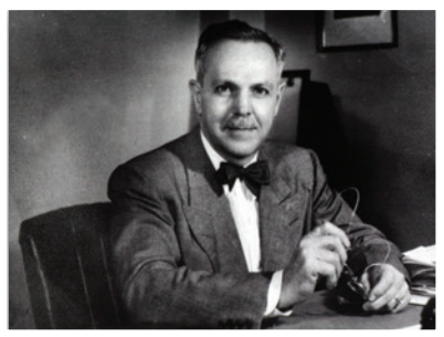
Alton Ochsner, ca. 1953

the efficacy of sulfa drugs (1940s) 5 and pioneered the use of Rifampin (1970s) 6 in treating the disease. They also developed the first animal model using armadillos (1971) 7 for studying the disease. In 1998, the National Hansen's Disease Program was relocated to Baton Rouge, although patients were allowed to choose whether to remain at Carville, receive a lifetime medical stipend, or relocate with the program.