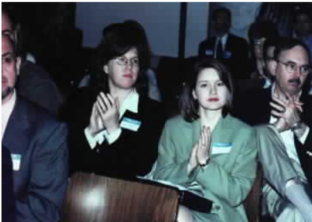
Audience intently listens to the keynote speakers