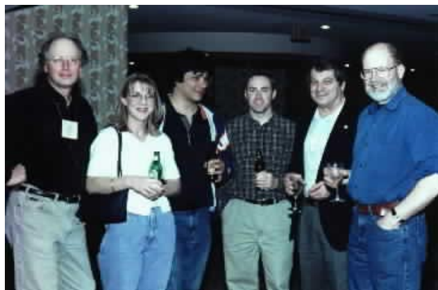
Friends gather at the UT Southwestern Texas Party!