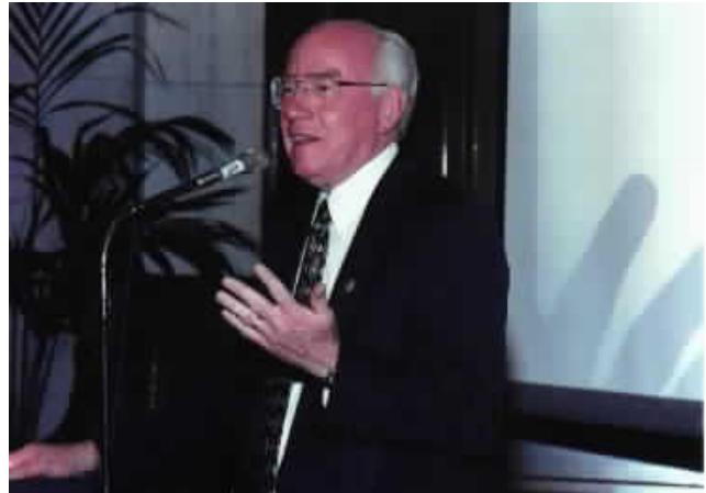
Congressman Vern Ehlers (R-MI) stresses the importance of science in America.